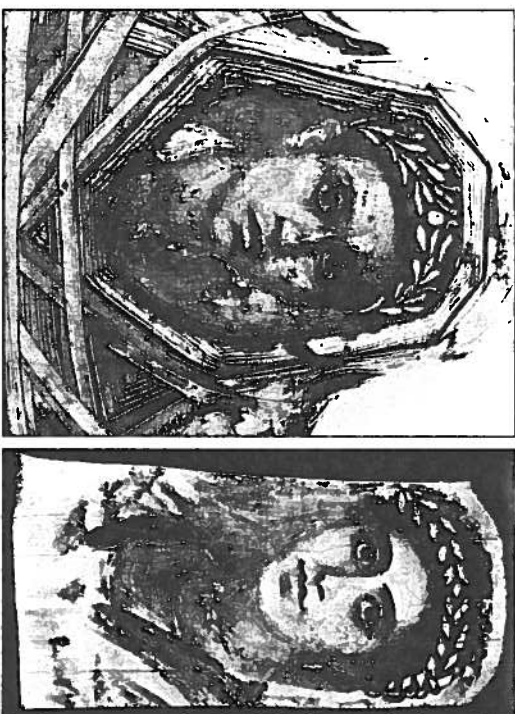
Roman faces: the so-called Fayum portraits, preserved for two thousand years

These first lucky wanderers were drawn from what historians refer to for convenience as “the imperial elite.” This group, at the peak of the Empire’s elaborate social pyramid, included both the traditional Roman blue bloods and aristocrats from the provinces—the well-born peers of Ephesus, Cadiz, Athens, and Marseilles, who had often studied in Rome and lived here for much of their lives. These imperial Brahmins formed a tight-knit, homogeneous caste, immediately recognizable—by their